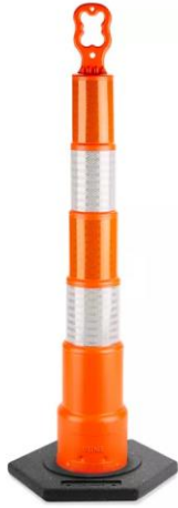
42" Channelizer Cone ($50)