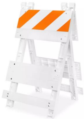
Folding Barricade ($100)