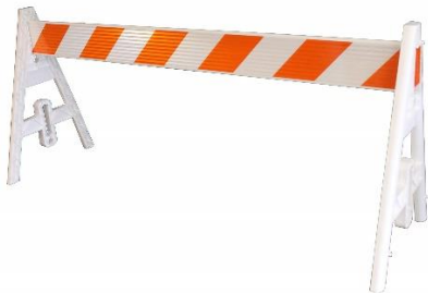
A-Frame Barricade ($150)