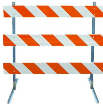
Type III Barricade ($300)