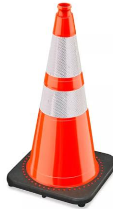
28" Traffic Cone ($50)